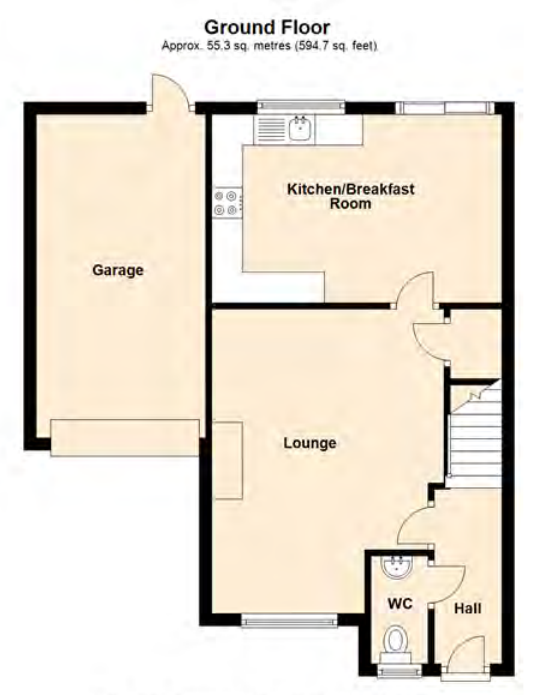
Total area: approx. 93.7 sq. metres (1008.4 sq. feet)

CHARTERED SURVEYORS LAND & ESTATE AGENTS